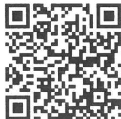
Our Lady of Mercy VANCO QR Code